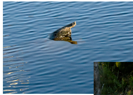
A basking turtle

The boardwalk around the lake has been re-opened following temporary repairs by AHC.