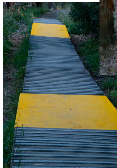
The repaired boardwalk